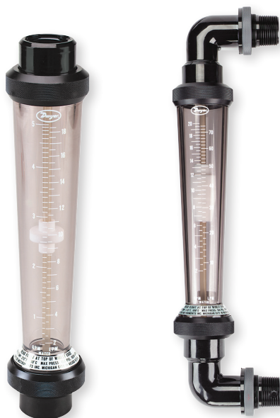
Shown with optional Polysulfone Fittings