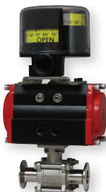
Model QV mounted to an actuator