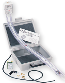
1212 Gas Pressure Kit