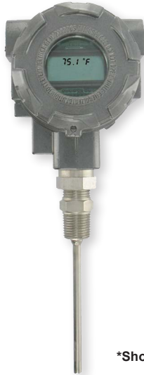
*Shown with optional LCD display

User Selectable Ranges, Optional LCD Display