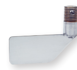
PDL-4 Minimum bulk density of 70 lb/ft 3 (1122 kg/m 3 ). Fits through 1-1/4" coupling eliminating the need for a mounting flange.