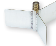
PDL-2 Minimum bulk density of 30 lb/ft 3 (481 kg/m 3 ).