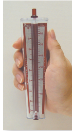
Hold this way for low scale reading