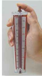
For high scale reading, finger covers hole