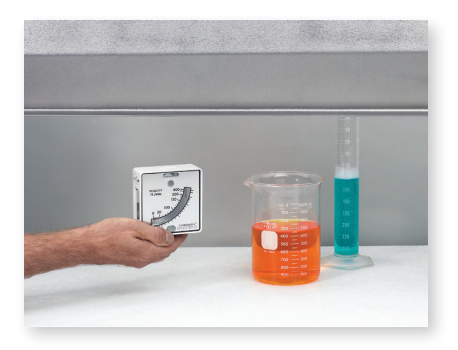
Use a Vaneometer™ Swing Vane Anemometer to measure velocity of air flow into laboratory fume hoods and at paint spray booths to determine when to change filters. Or wherever needed to meet OSHA standards of ventilation for smoke, dust or fume removal.