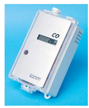
CO-T1D wall mount model with LC Display