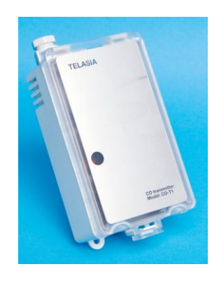
CO-T1 Wall mount model

The CO-T1 is a simple CO sensor/transmitter designed specifically for these applications. It delivers all the advantages of electrochemical sensing in a durable, long life (5-year) package and at attractive low price. The 2-wire loop powered sensor delivers a linear 4~20mA output that is easily integrated into any building control, ventilation or alarm system.