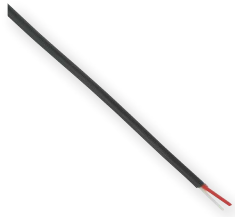
J type - FEP