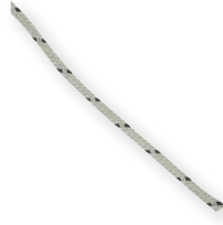
J type - FB