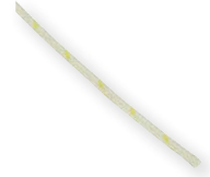
K type - FB